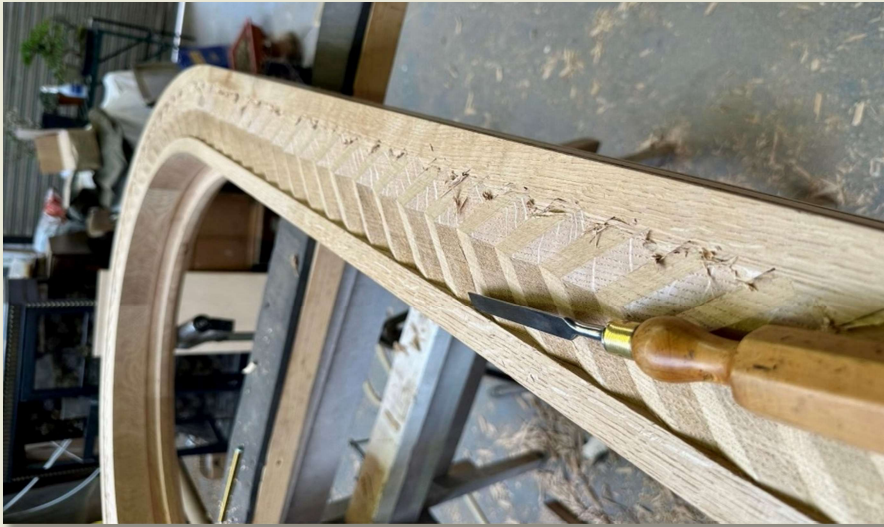
TOL – Scribed Door Frame c/w Decorative Hand Carving